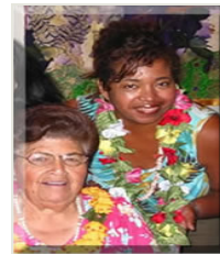
My Grandmother and I having fun at a Hawaiian party.

I have fond memories of Easter holiday. Especially when I think of dyed eggs and watching my Dad dye the eggs in "unusual" colors. As a little girl that was one of my Dad's "favorite" Easter holiday traditions. I would have one hard-boiled egg in my school lunch box everyday for lunch. By the end of the week, I had enough of eggs! But now it's fun memories. Now, I find myself repeating these things with some of my clients. I ask the seniors I work with if they would like to dye eggs. At first they seem to be reluctant, but then I see joy in their eyes and the fun it brings. Seniors begin recounting stories and memories past. It brightens their day to feel they are being productive doing what brings them pleasure. Some of the things we do with our children should be shared with our elder loved ones. Not to long ago my Grandmother would bake her "traditional" Easter Bunny loaf cakes. Grandma now does the icing and decorating of the baked loafs while I do the cake mixing and baking. It gives me pleasure to see my Grandmother having fun.